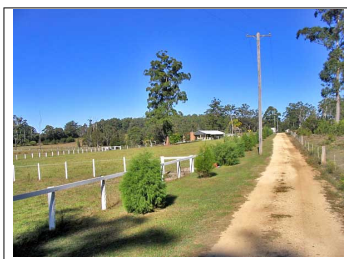
Access roads and lanes need to be wide enough to accommodate heavy machinery

importance of adequate access for trucks, heavy machinery, horse trailers, etc. It is difficult to anticipate why you might want to get a huge truck into an area that seems to only need access now, during the construction phase. This is where proper planning comes in.