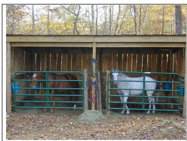
Permanent structure suitable for covering feeders and waterers

also make it more convenient to see what your horses are doing especially in a broodmare operation. The wider the doorway the easier the access is. Plenty of natural light is also of vital importance. Many of the features that improve ventilation also improve natural lighting and hygiene.