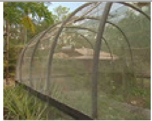
Temporary structure made of heavy duty ag pipe and shadecloth which could be adapted as a cover for feeders and waterers

All feeders (hay and grain) and waterers should be under cover to avoid contamination from bats or other animals and birds. These covers can consist of permanent structures like sheds or stables, or heavy duty shade cloth temporary structures placed over water troughs and feeding areas.