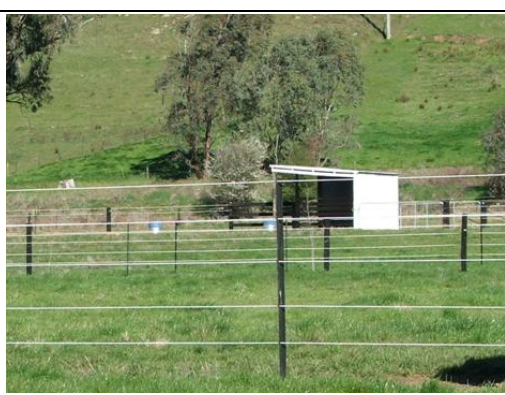
Strip fencing and Shelter

A sacrifice area can be anything from a box stall to a pasture. For most horse owners a sacrifice area will be a paddock or yard. It is simply a term used to best describe a small enclosure where you will give up the benefit of grass or vegetation for the benefit of your pastures. Horses should be confined to sacrifice areas when overgrazing presents a threat to pasture grass or during the rainy season when the ground can become sensitive to erosion or compaction.