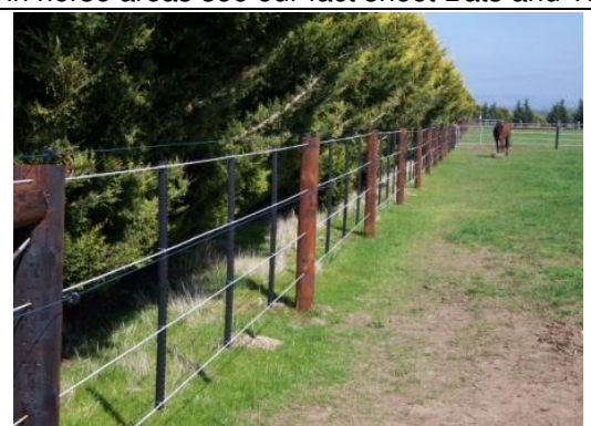
Single line windbreak of trees that don't attract bats