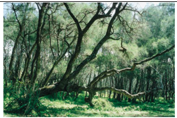
An undesirable tree planting for a horse property Grove plantings can encourage roosting bats

Trees are to be treasured, but because of the risk of spillover of Hendra from bats to horses, they should now be positioned away from stables, yards and night holding paddocks. If you are starting from scratch with a new property, try and find an elevated and already cleared area to locate these.